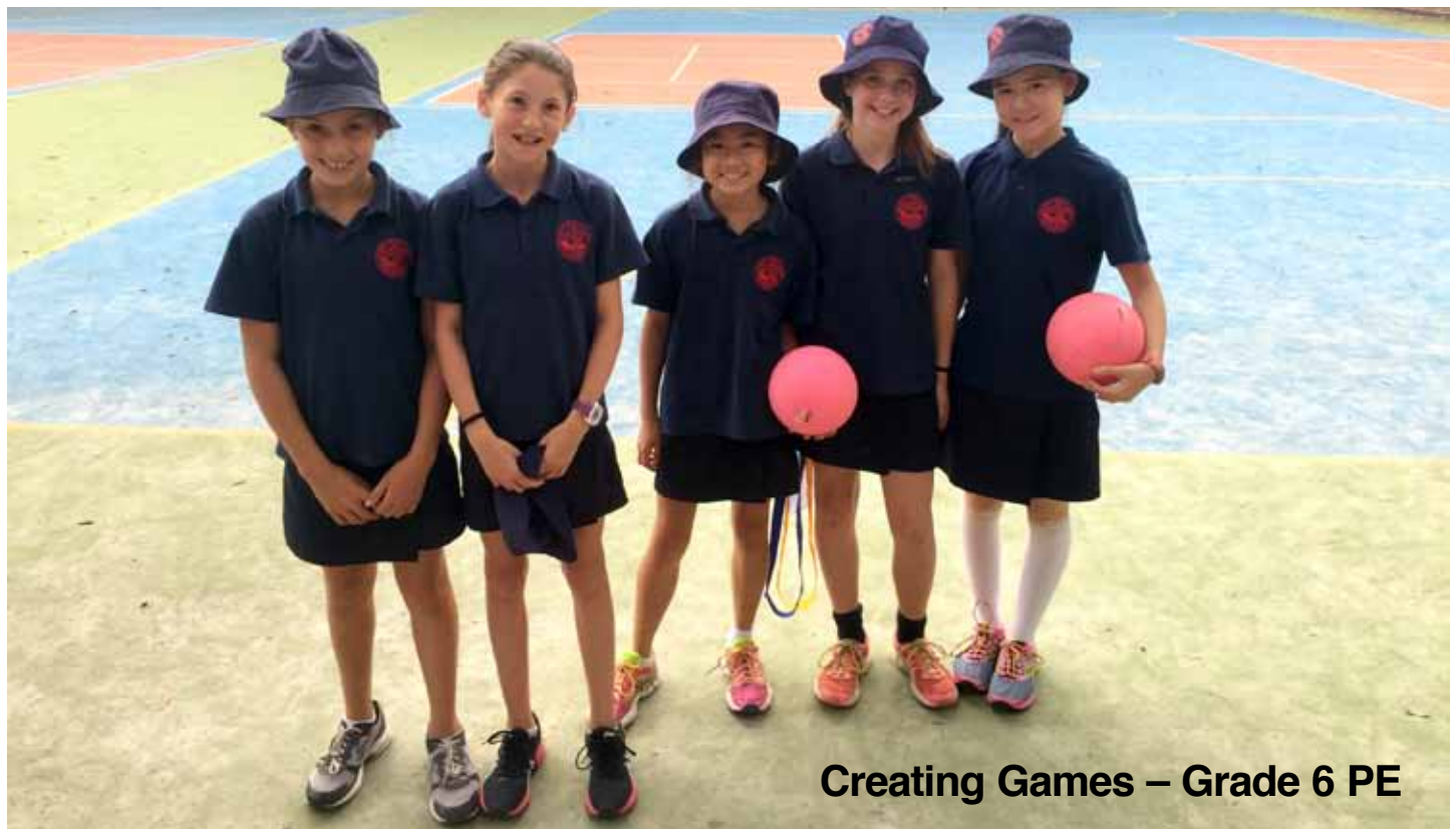
Creating Games – Grade 6 PE

Selling your house? Mention RPS at the time of listing and Biggin & Scott Richmond will donate $1,000.00 to the school. They will also donate $500.00 to the school for every new management property signed up, where RPS is mentioned.