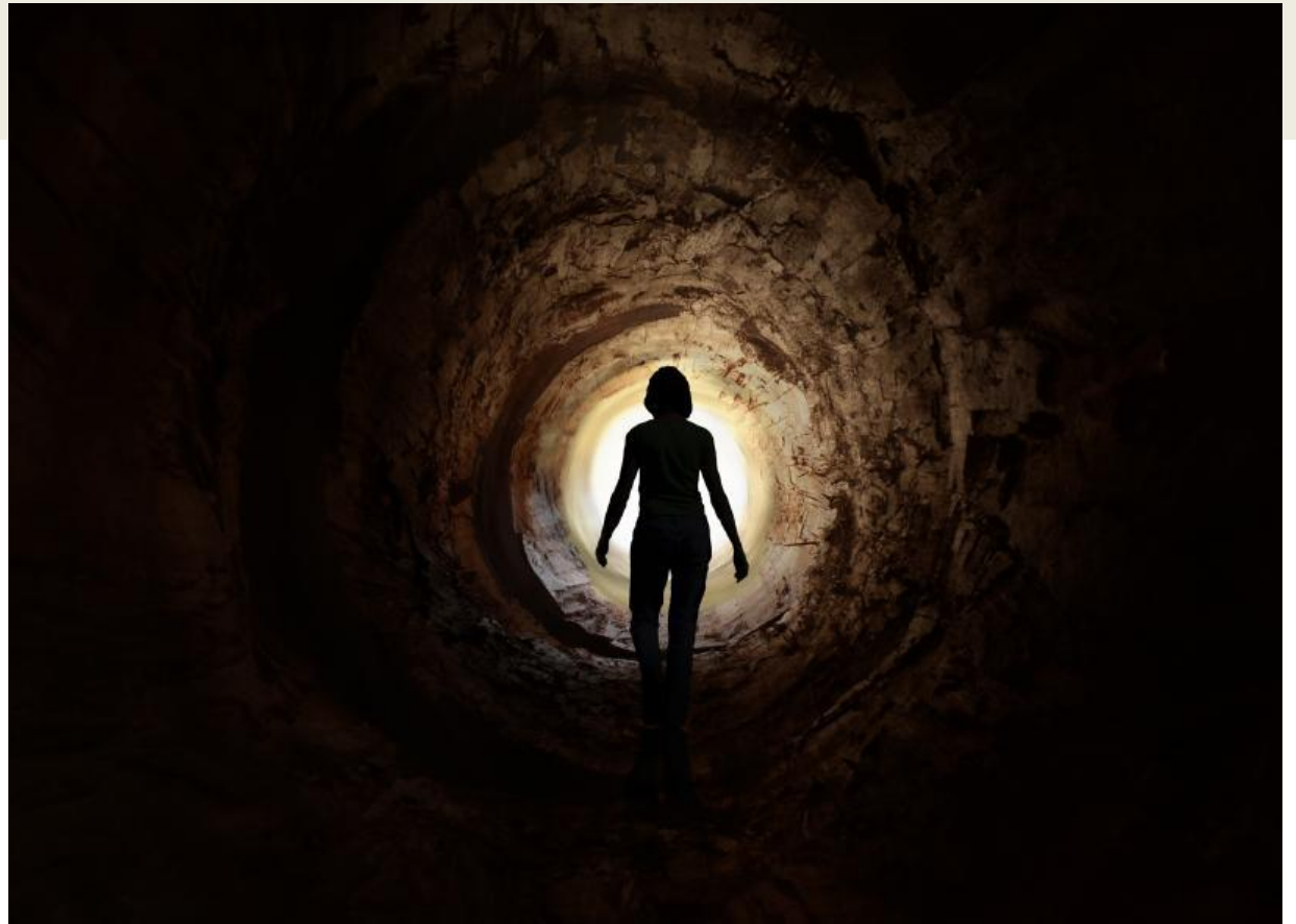
There is light at the end of the tunnel